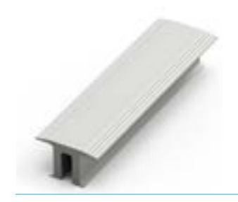
T frame (H: 9/16'')

You can use a T frame (I") to divide the matting into sections left-to-right — this makes it easier to lift and clean. Supplied in sections of I0' (3m) length with fixing screws and plugs. Comes in anodized aluminum, powder coated dark gray and black