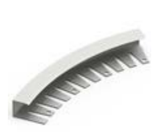
L frame (H: 5/8'')

Installing around a circular door or non rectangular space? You'll need a L frame to secure the matting. Size: 5/8" × 8' (15mm × 2.7m length)