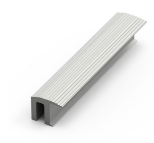
T frame (H: 14mm)