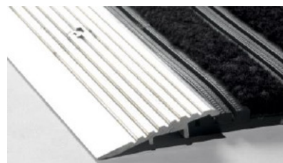
For edges, use locally available aluminium

Cover and protect entrance flooring system until final cleaning prior to opening.