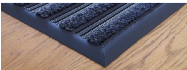
For edges, use PVC edging