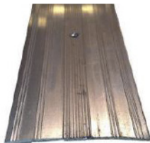
Same height between floors

Finish any exposed edges or transitions to other floor surfaces with locally available aluminum floor trims as examples below: