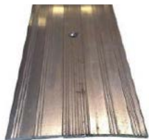
Same height between floors

Finish any exposed edges or transitions to other floor surfaces with locally available aluminium floor trims as examples below: