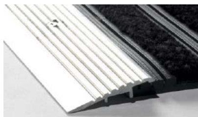
For edges, use locally available aluminium

Cover and protect entrance flooring system until final cleaning prior to opening.