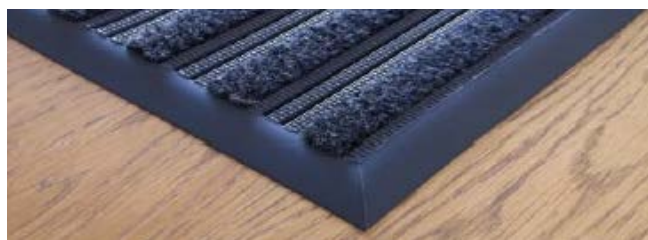
For edges, use PVC edging