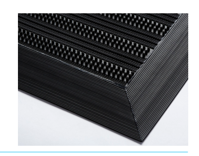
Easy to cut to fit on site, contours to uneven surfaces