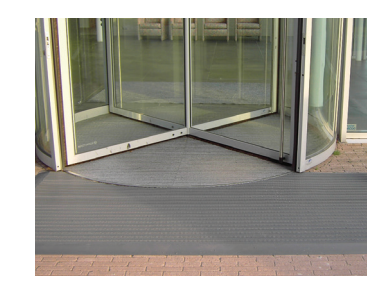
Comes in 10m (33') Made from flexible rolls or modules