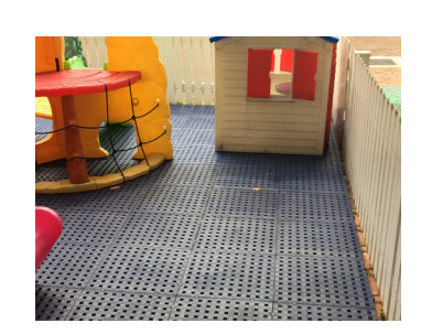
Secure 'lock fit' connection