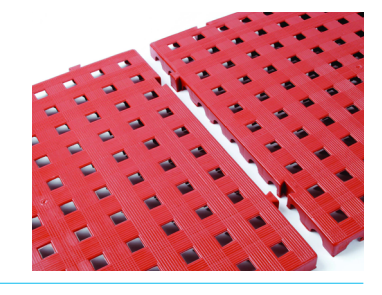
Easy to install, can be moved around as needed