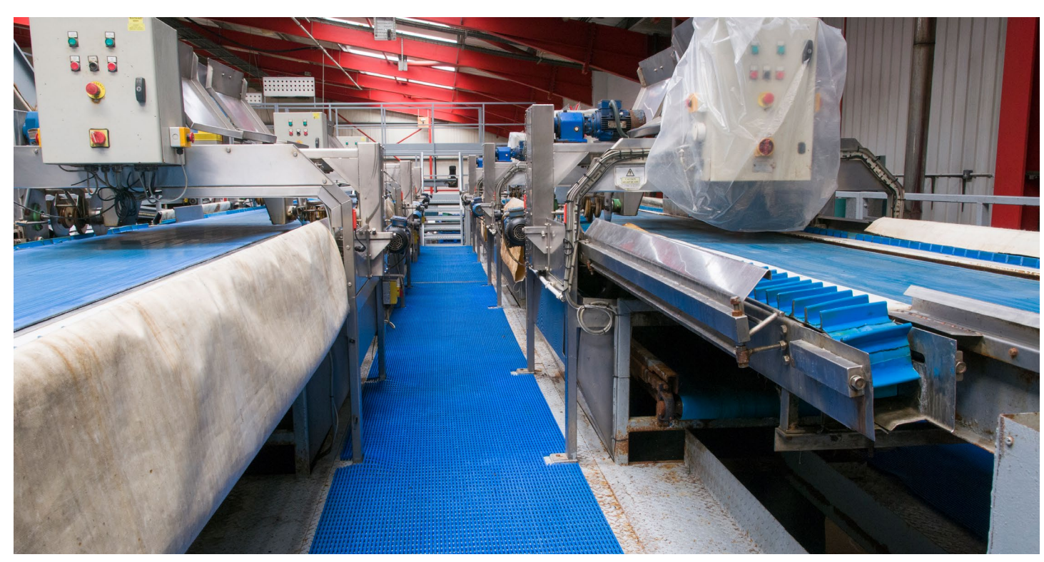
Designed to withstand all kinds of liquids, Vynagrip provides superior defence against slippery environments.

Hard-wearing, slip-resistant matting perfect for slippery environments and workplaces.